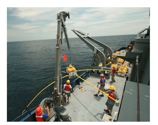
repare to deploy an electromagnetic instrument during a 'ition aboard R/V Melville off Nicaragua.

Hidden magma layer could play a role in earthquakes and other aspects shaping the geological face of the planet