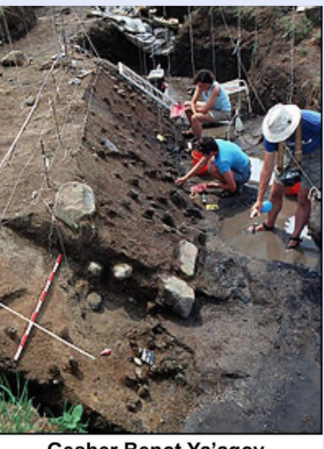
Gesher Benot Ya'aqov site in Israel

contemporary scholars, is consistent with The Urantia Book 's depiction of Andon and Fonta as the first human beings, who learned how to create fire and to pass this knowledge on to future generations. The site in Israel is located in the general area where The Urantia Book indicates the first tribes of human beings lived. However, it does not state this specifically. In order to get this understanding one must look at statements in The Urantia Book pertaining to the animals from which human beings evolved and from information about the first great spiritual teacher of