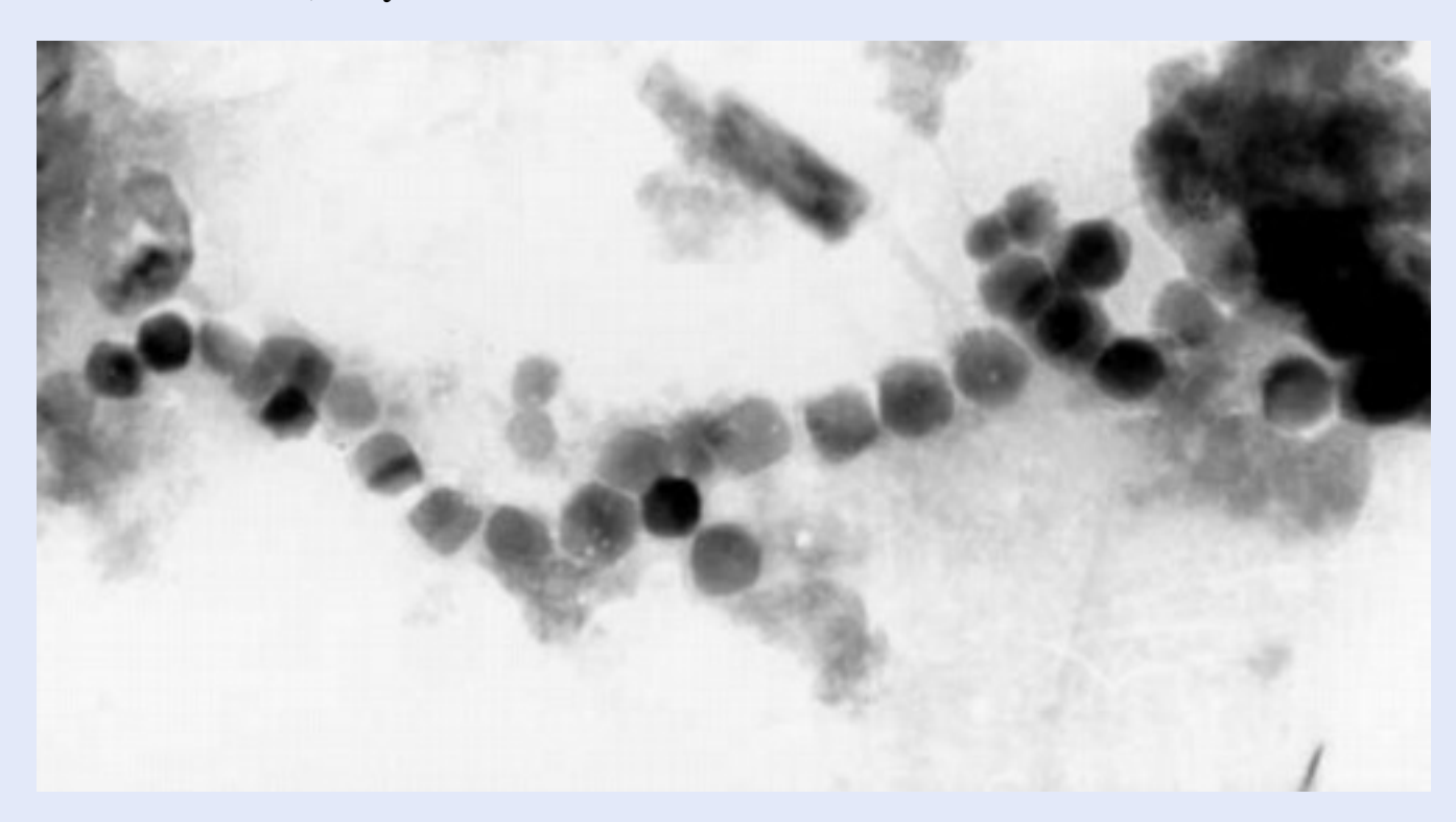
Above: A linear chain of biogenic magnetite crystals, extracted from tissues in the frontal region of the sockeye salmon, Oncorhynchus nerka , a close relative of the rainbow trout, Oncorhynchus mykiss . These are also single magnetic domains, with crystal alignments similar to those in magnetotactic bacteria.

Scientists are now asking the fundamental question: What is magnetite doing in the human brain? In magnetite-containing bacteria, the answer is simple: Magnetite crystals turn the bacteria into swimming needles that orient with respect to the earth's magnetic fields. Magnetite has also been found in animals that navigate by compass direction, such as bees, birds, and fish, but scientists do not know why the magnetite is present in humans, only that it is there.<sup>6</sup>