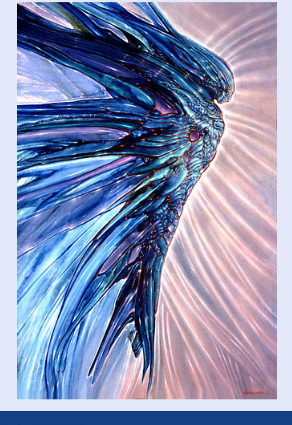
UBtheNEWS Verifying History and Science in The Urantia Book