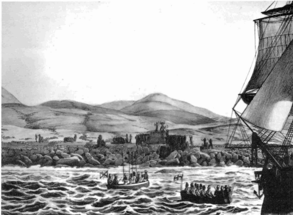
Alien European genes had little chance of being introduced to Easter Island in the early 19th century when visiting sailors could get no nearer to shore than this. The drawing depicts the Russian ship Rurick at the island in 1816.

Bahn and Flenley (1995:20) scoffed at my theory that Easter Island's original inhabitants were American Indians who died out as an ethnic entity because they had no