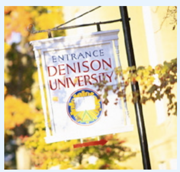
An Academic Achievement

The Nature of Religion class had about 17 students in it. The World Religions class was packed with thirty-three people, including the professor. That means this event at Denison University not only marks the first time I have presented at a university, but also sets the record for the most people that I have presented to (at least in relationship to this work).