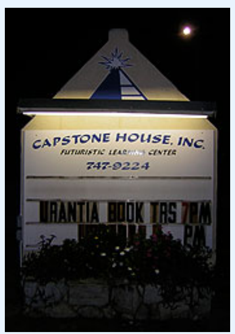
Capstone House marque

invite them to the UBtheNEWS presentation that was being held at the Gulf Breeze library the next night. Of the twenty-two people who attended the presentation, about one third of them knew nothing or next to nothing about the UB. It was a most delightful and effervescent group of people who attended and we all enjoyed an excellent potluck before the presentation.