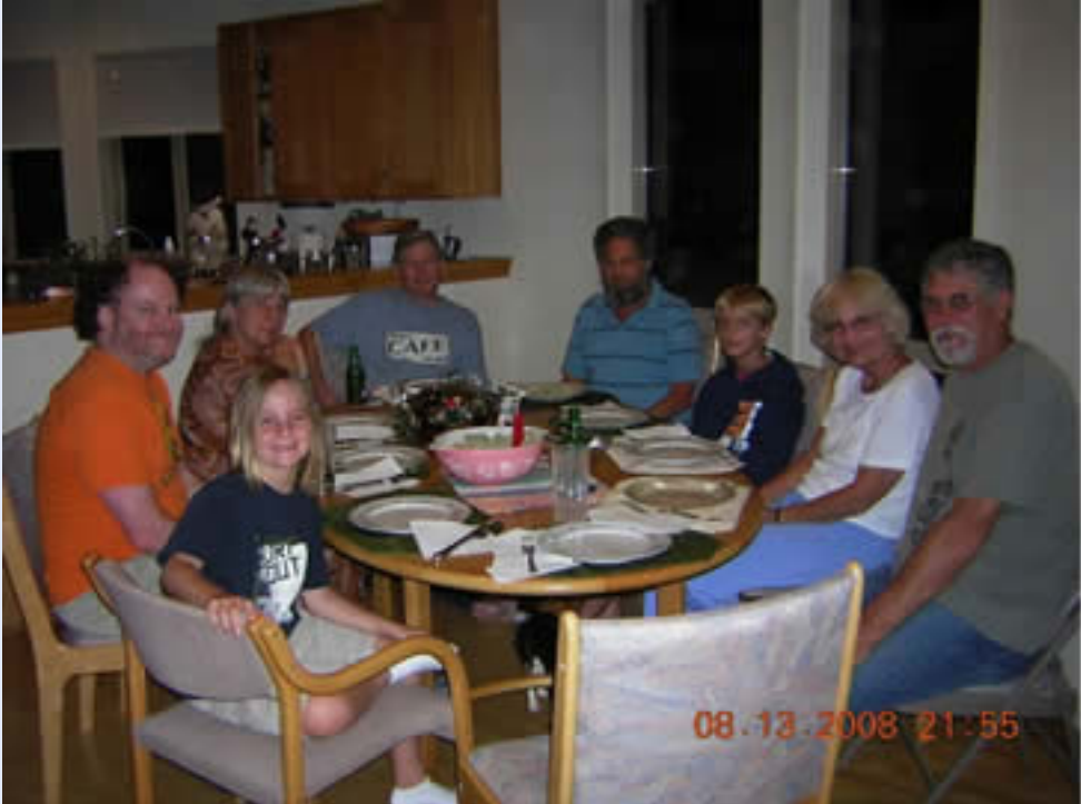
Dinner at Kindred Spirits

my college days. Okay, I guess by some definitions I could be considered a Deadhead. I have, after all, seen about thirty-five concerts.