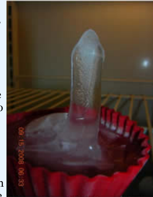
One Cool Halbertcicle